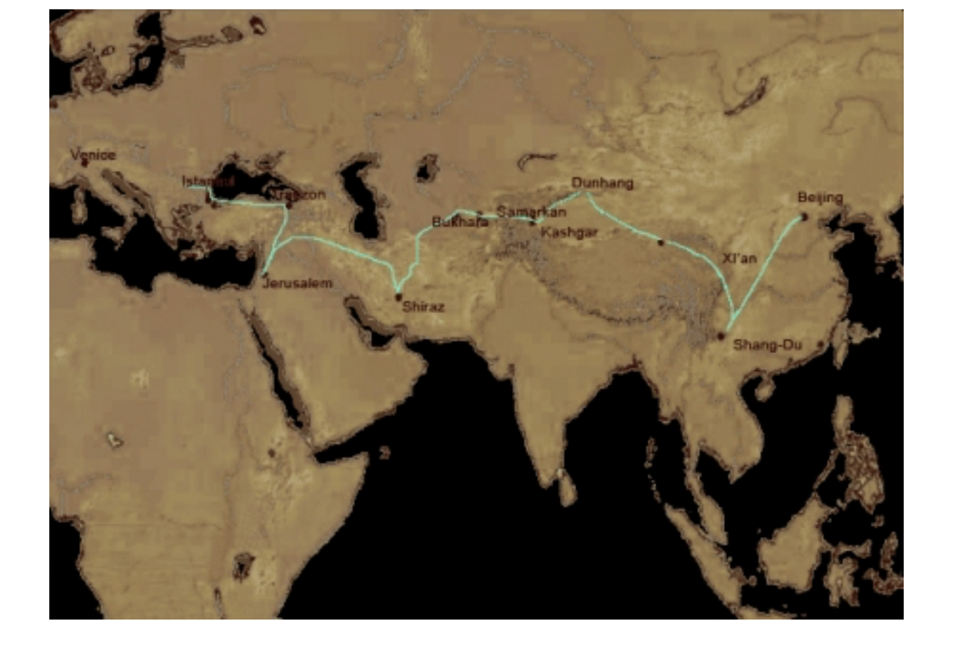
Ancient Silk Road

She formed an organization, called Peace Caravan, the mission of which is to nourish the principles of international cooperation, exchange cultural values, share understanding of the environment, and foster the equality of all peoples, including women and children.