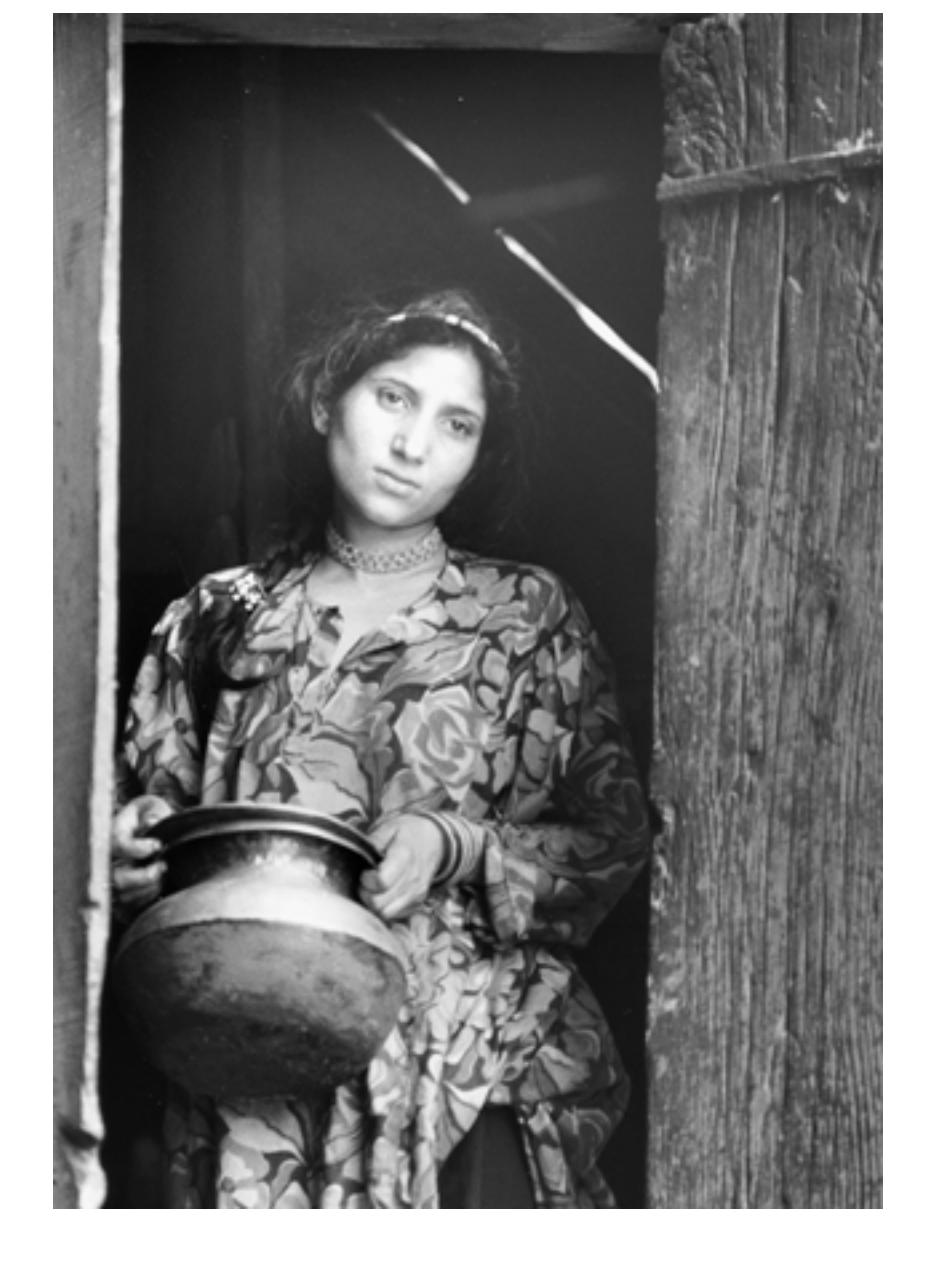
Woman Carrying Water - Dal Lake, India

She states that, after the Hebrews, human consciousness moved away from earth to man-made non-earth, so that the leading religious role for a woman was to give a virgin birth to a Divine Savior.