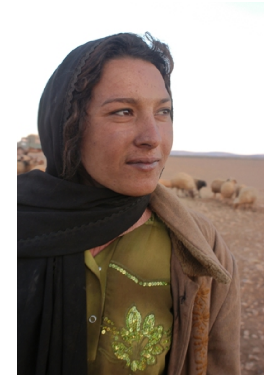
Bedouin Girl - Desert near Palmyria, Syria

She recounts one episode of circumstances beyond her control. "I had to cross the border from Turkey into Syria," she expounds. "There was a crossing point 30 minutes from where I was staying, but that area had been bombed by Israelis the month before. So, I arranged for a taxi to take me to another crossing point two and half hours away. I gave the hotel the taxi's license number and told them where I was going.