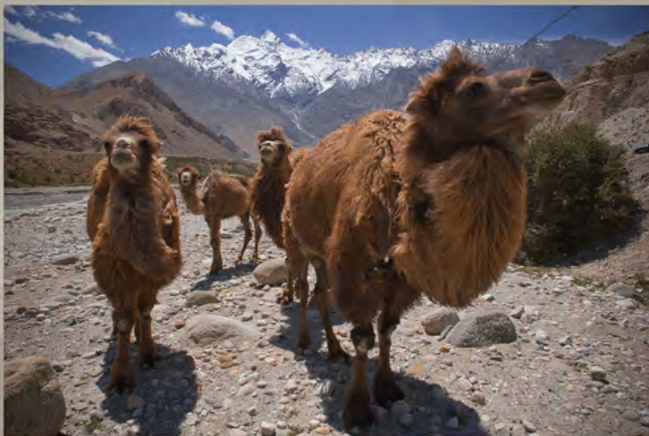
Karakoram Highway, Pamir Mountains