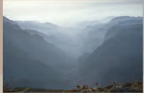
Dead Sea, Jordan

The Silk Road was a series of intersecting caravan trails from Southwest China to the Mediterranean, and ultimately arriving in Rome. It was more than a road where merchants exchanged goods, but was a formative and transformative rite of passage of religious and cultural heritages within the Diaspora.